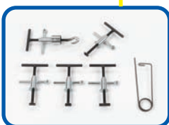
Set of 5 mechanical locking clamps with terminals with wing and hook shape Cod. K0263