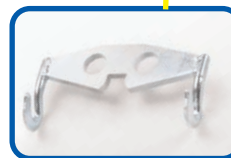
Connection bridge Cod. K0264