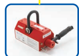
Permanent magnet PM500 Cod. K0360