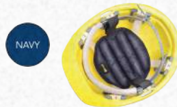
MIRACOOOL® HARD HAT PAD 968