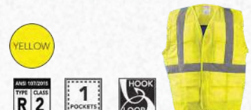
MIRACOOOL® PLUS COOLING VEST 901