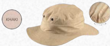
MIRACOOOL® RANGER HAT 962