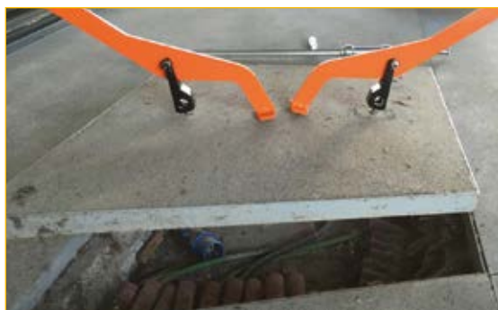
Opening larger lid can be done with two LB2.