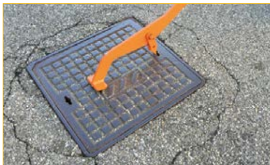
Inserting the hook into the slot and rotate to 90°.

Practical lever lifter for lids with latches or in the absence of cast iron surface. For the correct connection the lower hook is inserted into the slots on the cover and the lever is turned through 90°.