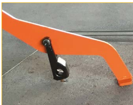
Possibility to custom hooks according to specifications if needed.