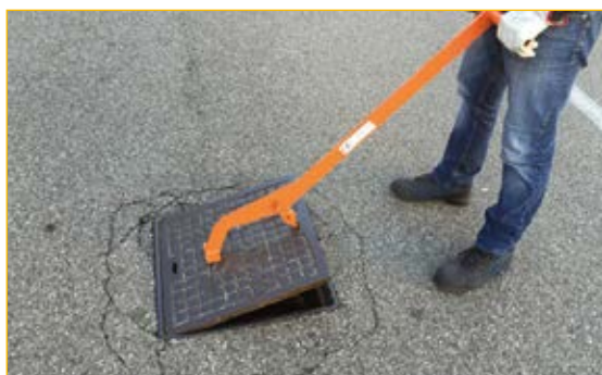
In the opening operation, the length of the lever limits the operator effort.