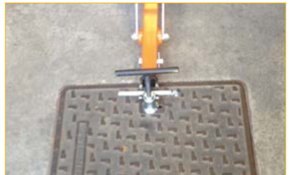
Phase 2: engagement of the lever in the clamp.