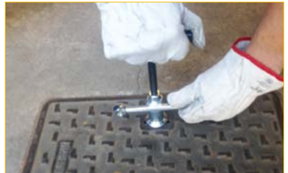
Phase 1: set the hook central bar in the position that can be hooked up by the APS90/APS80.