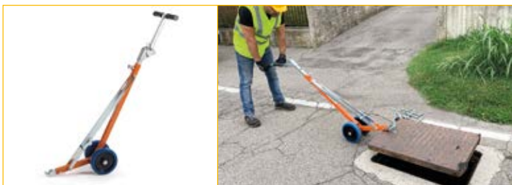
To be used with both APS90 or APS80