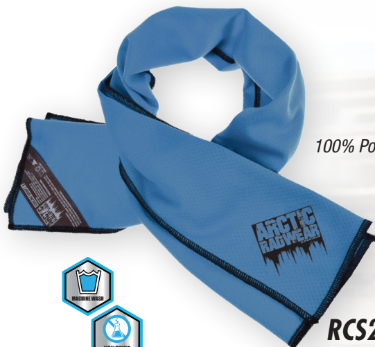
RCS20 - BLUE