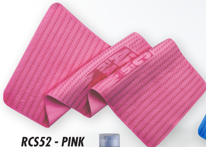
RCS52 - PINK