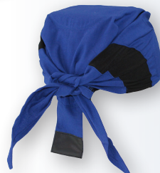
RCS305 - BLUE