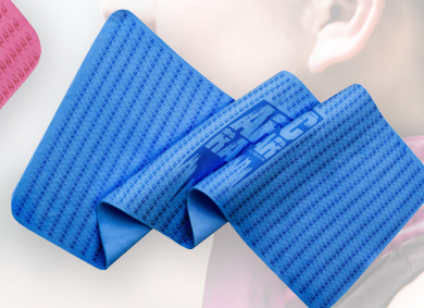
RCS50 - BLUE