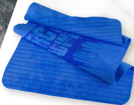
RCS10 - BLUE