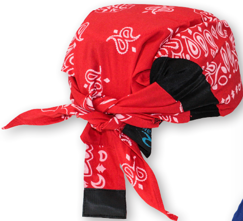
RCS307 - RED PAISLEY

Cooling HeadShade Design is protected under design patent number D746,555 / utility patent 9,241,522