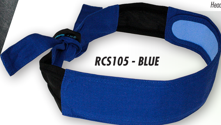
RCS105 - BLUE

Headband Stretch-Fit Design is protected under patent number D712094