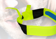
RCS110 - HIGH VISIBILITY LIME