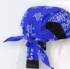
RCS308 - BLUE PAISLEY