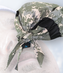
RCS309 - DIGITAL CAMO