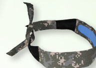
RCS109 - DIGITAL CAMO