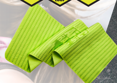
RCS51 - LIME